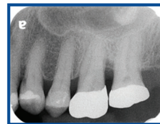
6 Months Post-Op #14: 3,3,5 | 5,3,3