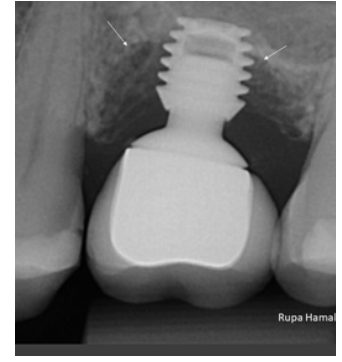
Pre-Op: 7,9,9 | 9,7,8