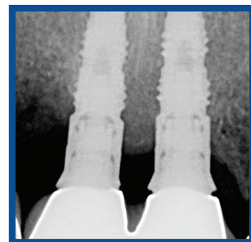
12 months Post-LAPIP Protocol Pocket Depths: 4,2,3 3,3,4