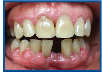
Pre-Op: April 2017

The patient was very comfortable and happy with the results, and stated that she "felt better than [she had] in many years." After the one year LANAP follow up, the patient has decided to do a second round of "touch up" laser treatment aimed at the posterior teeth that had been initially considered hopeless, that were now less mobile and no longer depressible. Hence, 15 months after the patient presented with 13 hopeless teeth, she had lost none and was interested in further laser treatment in order to further control her disease.