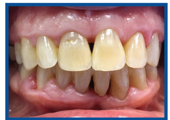
Post-Op: June 2018