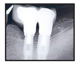
6 months Post-LAPIP™ Protocol