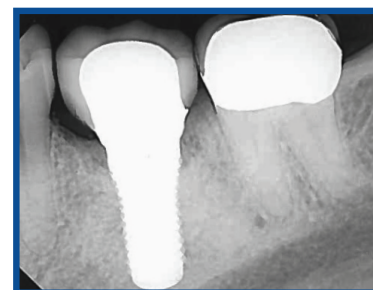
2 Years Post-Op