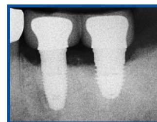
6 Months Post-Op #18: 4,5,5 | 5,4,4 #19: 5,5,5 | 5,4,4