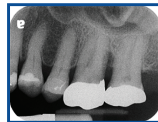
6 Months Post-Op #14: 3,3,5 | 5,3,3