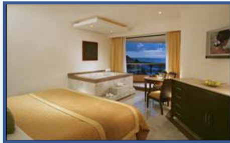
Standard suite room (king or double) includes private Jacuzzi, balcony and many other luxury amenities!