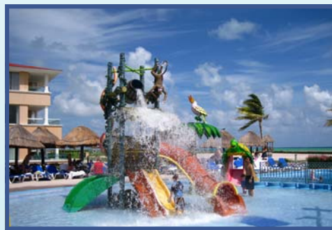
9 swimming pools, plentiful beaches and activities and events for the entire family!